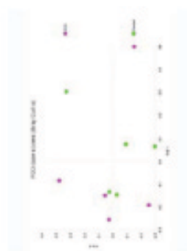
Figure 2. PCO ordination of UC cases